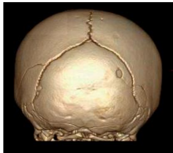
Figure 2: Computed tomography 3-D reconstruction showing bilateral parietal skull fractures including additional lucency on the right that crosses the lambdoid suture and communicates with a small occipital bone defect.

Bilateral skull fractures may result from accidental or abusive mechanisms, involving double-impact, compression of the head between two surfaces, or single impact onto the calvarial vertex or occiput. Although bilateral skull fractures in an infant are suspicious for abuse, a